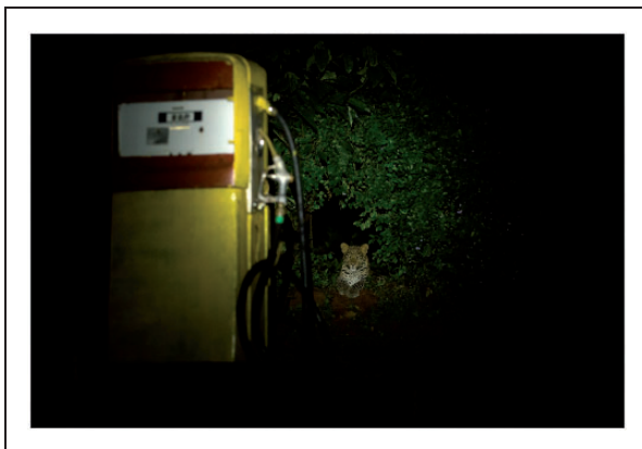
Figure 2. Leopard in a fuel station amidst plantation-habitat mosaic in the Anamalai Hills, southern India.