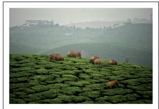
Figure 4. Elephants in a tea plantation in the Anamalai Hills, southern India.