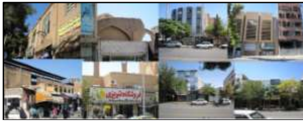
Figure 4: Building Façade in Sabzevar CBD Paths