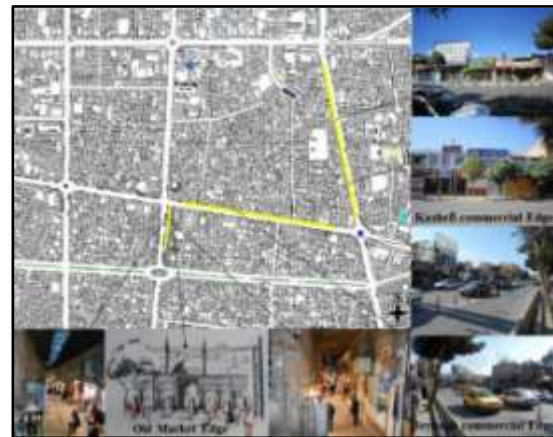
Figure 5: Edges in Sabzevar CBD

c) Landmarks: readily identifiable objects; Sabzevar CBD is situated in the historic-old part of the city and has buildings with great historical and architectural values, therefore, any of such monuments can be considered landmark within the entire city center. Landmarks are the point of references and are externally defined features or physical objects such as buildings, activity centers, monumental objects or natural elements such as mountains, river, tree and etc. some landmarks may also have directional attributes or some are the distant ones i.e. seen from many angles and distances [6]. The major landmarks of the city comprises of: