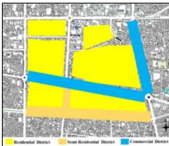
Figure 9: Commercial District of SabzevarCity Center