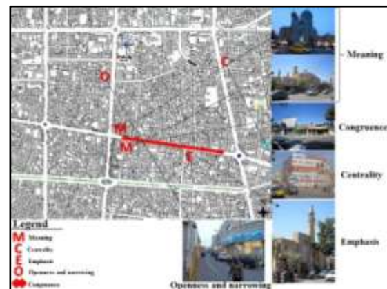
Figure 3: Features of Sabzevar CBD Paths

Street is understood to be continuous and impacts of each sequence on human mind gives him an overall image of the space. Placement of each sequence next to another would create the view for people. In the CBD area the shops, offices, public units and etc. have been located on the either side of the main streets which define the quality, function and even the character of the pathway. The building material used in these buildings varies from street to street, in the old streets such as Beyhagh and parts of Asrar, the common used material on the elevation is brick and in some older buildings is clay giving them a predominant red color with cream accents, distinct patterning due to the size of the brick and unique textural quality. But the facade in Kashefi, AsadAbadi, Modares and Atamalek is treated with more contemporary materials such as stone cladding, aluminum panel and glass combination or rowlocks since the buildings are new.