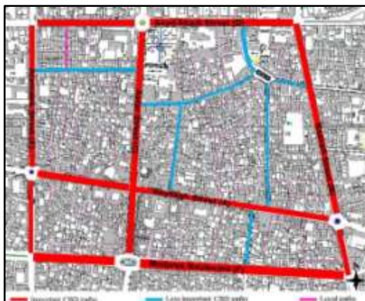
Figure 2: Paths in Sabzevar CBD

Identification of these paths is important to locate the specific function of the CBD axis and streets leading to them. In addition for enhancement of streets performance it can enrich the perceptual map of citizens. The streets of CBD are the paths that each consecutive sequences of them have different qualities. The main features of these sequences are: