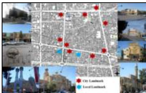
Figure 6: Landmarks in Sabzevar CBD

Among the landmarks of the city center, Imam Zadeh Yahya and Jama` mosque are the most significant landmarks as an urban elements. Imam Zadeh Yahya is located at the Asrar-Beyhagh junction and the Jama` mosque is placed at the southern side of Beyhagh Street. These two elements can be seen from different points of the surrounding streets due to the height advantage. Visual connection to the Imam Zadeh Yahya provides the sense of identity for the citizens.