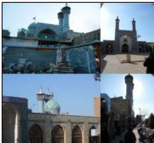
Figure 7: Imam Zadeh Yahya and Jama Mosque as the Community Identity in Sabzevar CBD

Among the landmarks of the city center, Imam Zadeh Yahya and Jama` mosque are the most significant landmarks as an urban elements. Imam Zadeh Yahya is located at the Asrar-Beyhagh junction and the Jama` mosque is placed at the southern side of Beyhagh Street. These two elements can be seen from different points of the surrounding streets due to the height advantage. Visual connection to the Imam Zadeh Yahya provides the sense of identity for the citizens.