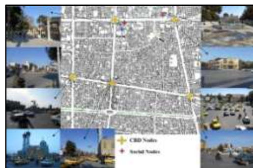
Figure 8: Nodes in Sabzevar CBD

e) Districts, relatively large sections of the city distinguished by some identity or character; Districts are one of the important elements of shaping an area which would create a clear image of the place in the people's mind. In Sabzevar CBD area the following spaces are identified as important districts: 1. the commercial or business districts and, 2. the residential districts.